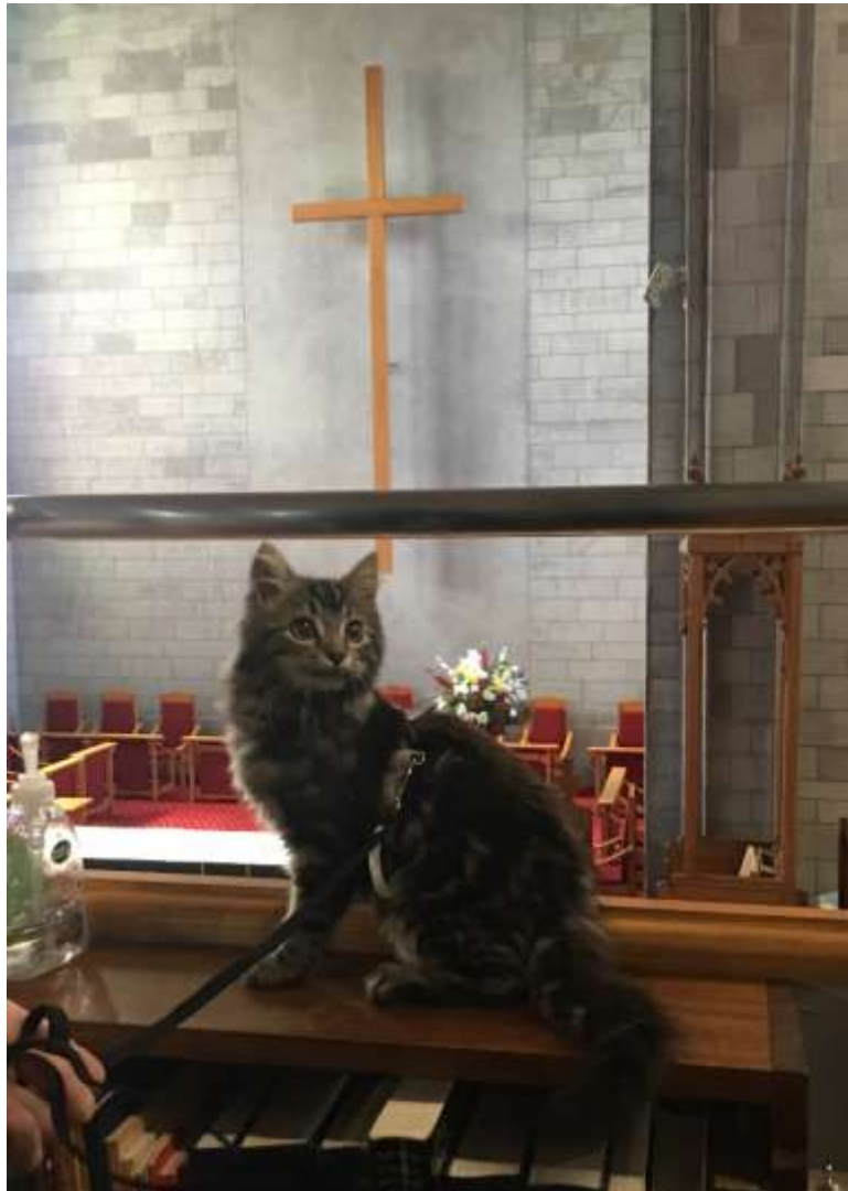
Zeke, belongs to Rebecca, one of our choir members